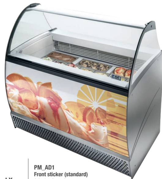
LX PM_AD1 Front sticker (standard) Adesivo frontale

Colori disponibili Available colours Fianchi laterali / Griglia inferiore Side panels / Bottom front grid Grigio E_Z065